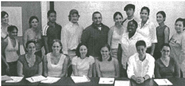
Urban Studies students, Fall 2003.

The undergraduate fellowships grew out of Urban Studies, the undergraduate class and seminar jointly sponsored by CURL and the College of Arts and Sciences. The Urban Studies class began in 1997. As part of the class requirements, students were assigned to assist in the research of a current CURL collaborative project.