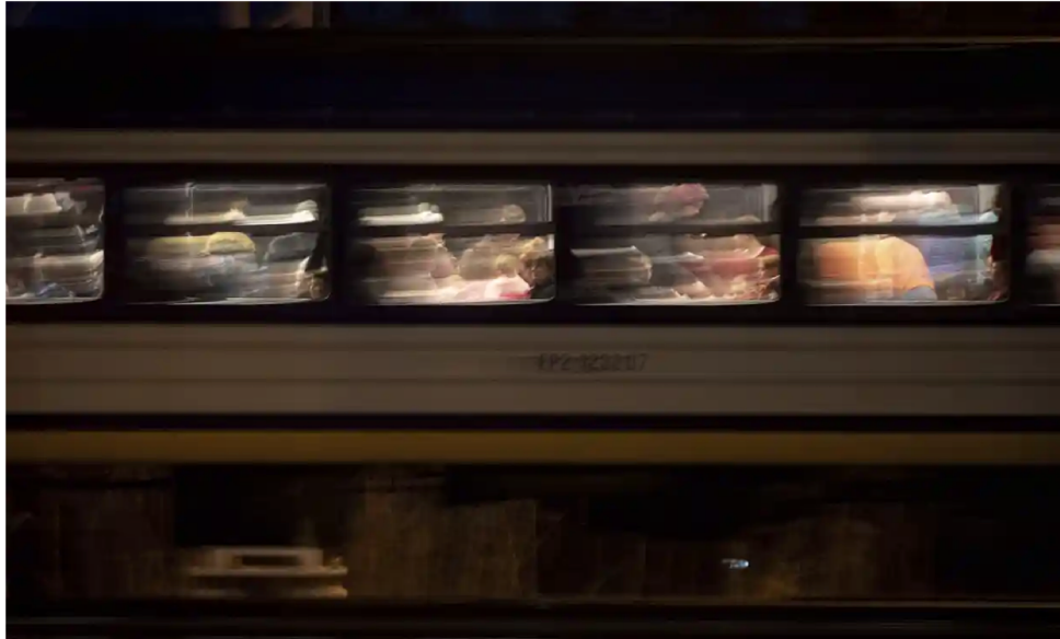
📷 A train of refugees fleeing Ukraine.

The mother of an 11-year-old boy from Ukraine who travelled for nearly 700 miles to Slovakia with just a plastic bag, a passport and a telephone number