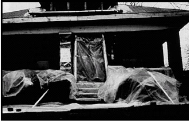
Figure 8.3b Prepare the Worksite With Plastic Sheeting (exterior).