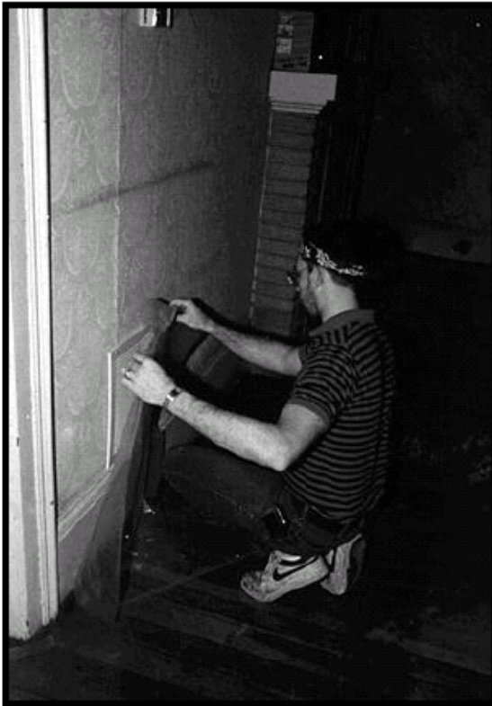
Figure 8.5 Cover the Air Vents With Plastic After Turning Off the HVAC System.