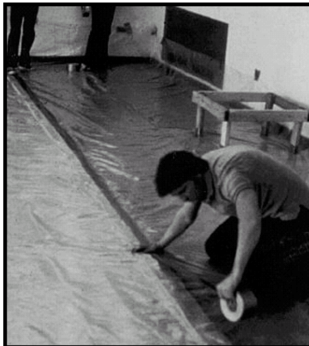
Figure 8.3a Prepare the Worksite With Plastic Sheeting (interior).