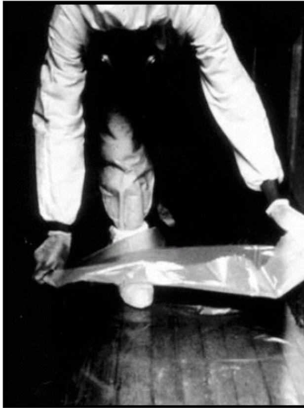
Figure 8.4 Apply a Second Layer of Plastic.

The first case involves floor sanding. Even if the paint has already been removed, leaded dust generation is likely to be quite high due to residual dust in the flooring. Enclosing old