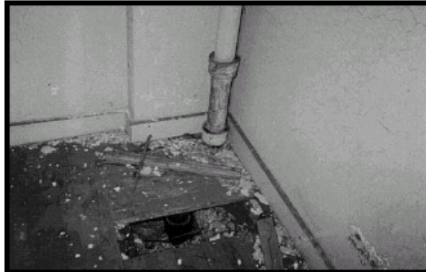
Figure 8.2 Area Should Be Precleaned and Structural Deficiencies in Flooring Repaired Before Lead Hazard Control Begins.

If bathrooms are not accessible, residents should always be relocated during the day (Table 8.1, Level 2 at a minimum) unless alternative arrangements can be made (e.g., use of a neighbor's bathroom). In addition, if construction will result in other hazards (such as exposed electric wires), then residents should also be relocated.