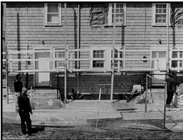
Figure 8.3c Prepare the Worksite (exterior).

If a worksite preparation level is selected that permits residents either to remain inside the dwelling while work is being conducted or return to the dwelling in the evening after work has been completed, then a dust sample should be collected from the living area at greatest risk of contamination (usually the living area adjacent to the work area) at the end of each work day. It is essential that the sample be collected before the work area is cleaned to determine if the containment system protected the