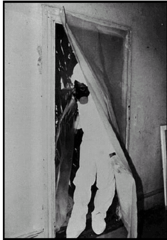
Figure 8.6 Install a Simple Airlock Over a Doorway to Minimize Lead Dust Migration.

some reason abrasive blasting without local exhaust ventilation is performed on the interior of a dwelling, a full containment structure with HEPA filtration and adequate airflow should be required. Such a containment system would also be necessary if the exterior of a dwelling was blasted, usually resulting in "tenting" an entire building (i.e., erecting a temporary tent-like structure around a building or one face of a building).