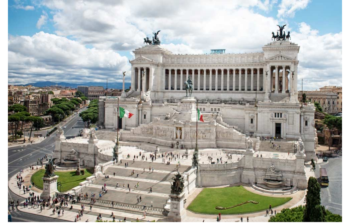
Victor Emmanuel II