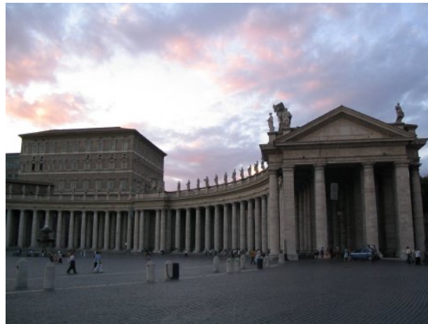
St. Peter's Square/Basilica