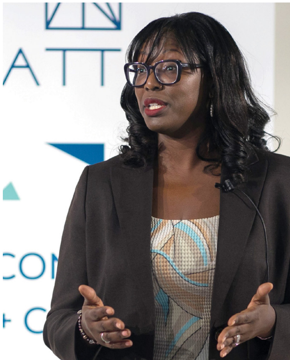
Keynote Speaker, 2023 Health Equity Quest

Each year, Health Equity Quest focuses on a topic related to society's changing needs. In its debut year, 2021, the event looked at health equity and emerging infectious diseases. In following years, themes turned to topics such as the intersection of health and rapid climate change as well as justice within health care systems and the natural environment. In fall 2024, Health Equity Quest will explore mental health for early career professionals in partnership with Alight, a leading cloud-based human capital technology and services provider for employee benefits administration.