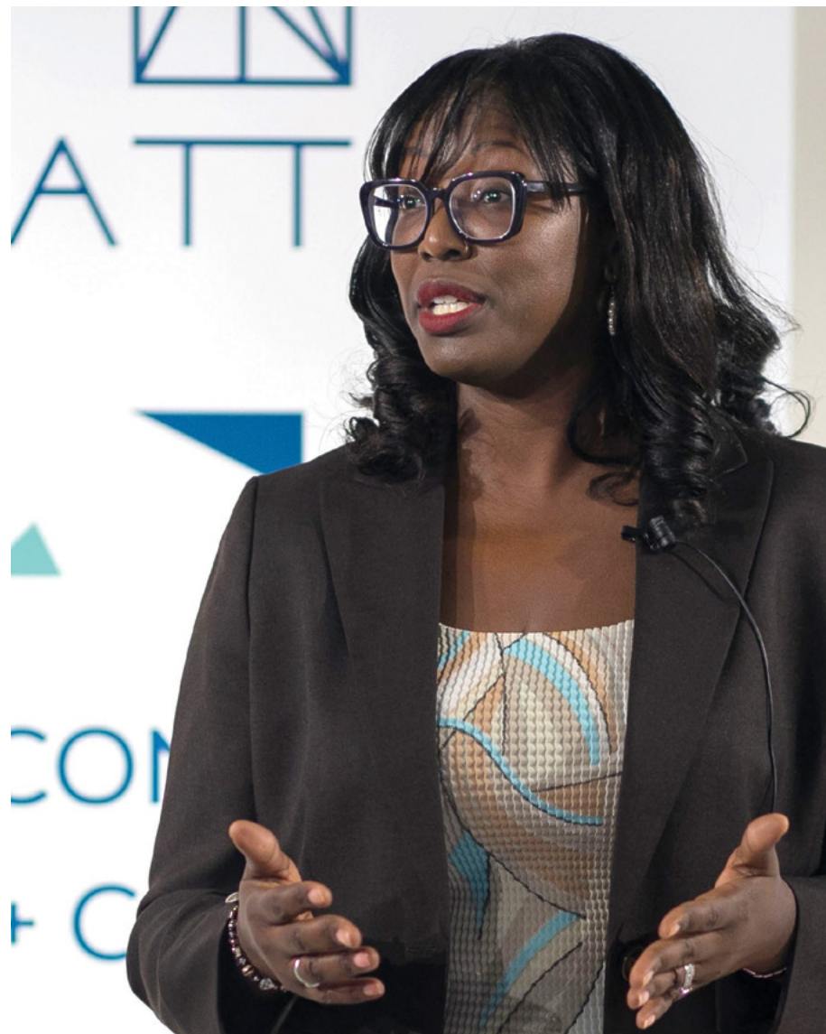
Keynote Speaker, 2023 Health Equity Quest

Each year, Health Equity Quest focuses on a topic related to society's changing needs. In its debut year, 2021, the event looked at health equity and emerging infectious diseases. In following years, themes turned to topics such as the intersection of health and rapid climate change as well as justice within health care systems and the natural environment. In fall 2024, Health Equity Quest will explore mental health for early career professionals in partnership with Alight, a leading cloud-based human capital technology and services provider for employee benefits administration..