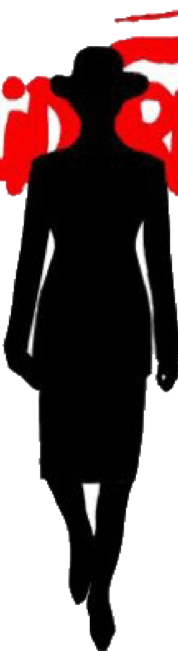
this image is a feminist artistic response, by Slovenian artist Sonya Ivekovi, to the High Noon election poster used by Solidarity in the 1989 election campaign.